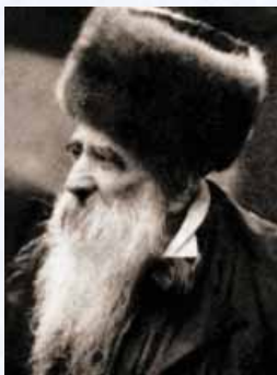
RAV YISSOCHOR DOV OF BELZ

May we merit the removal of chometz - both physical and spiritual - leaving not even the smallest trace capable of reawakening, with the true and complete Geula. ■